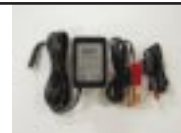
Battery Fighter® Junior